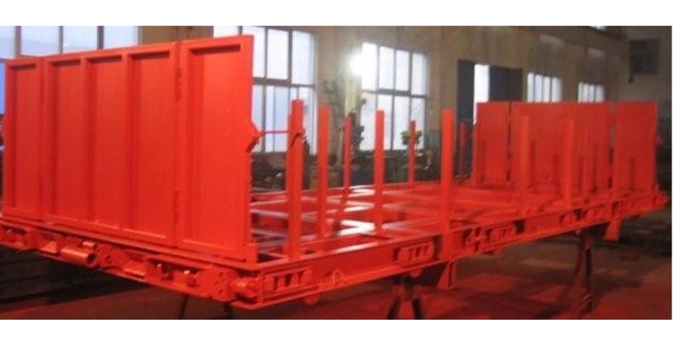
20' MTT with bulk-heads

Fold away bulk-head to allow for multistacking