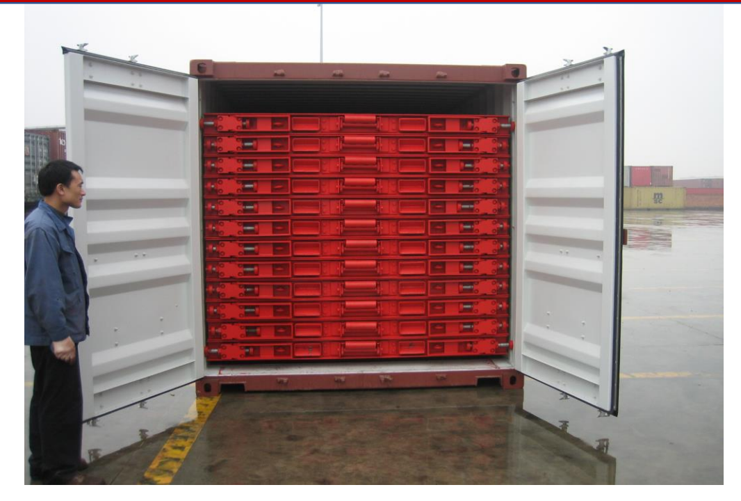
OCEAN - RAIL - TRUCK